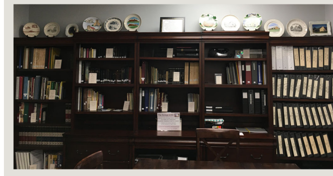
The updated Heritage Center Library in Eureka.