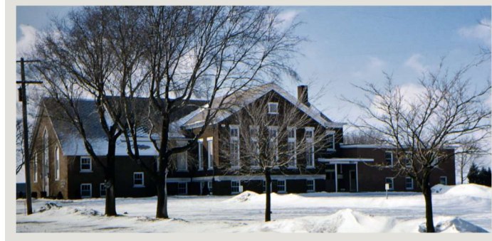
Previous assembly houses used by the congregations at Princeville (top) and Roanoke (bottom)